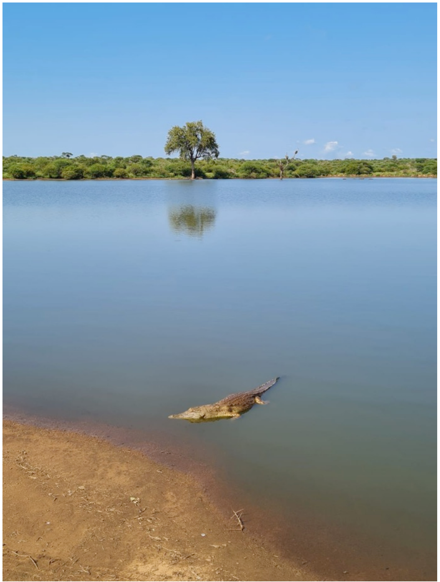
Sunset dam @ Lower Sabie